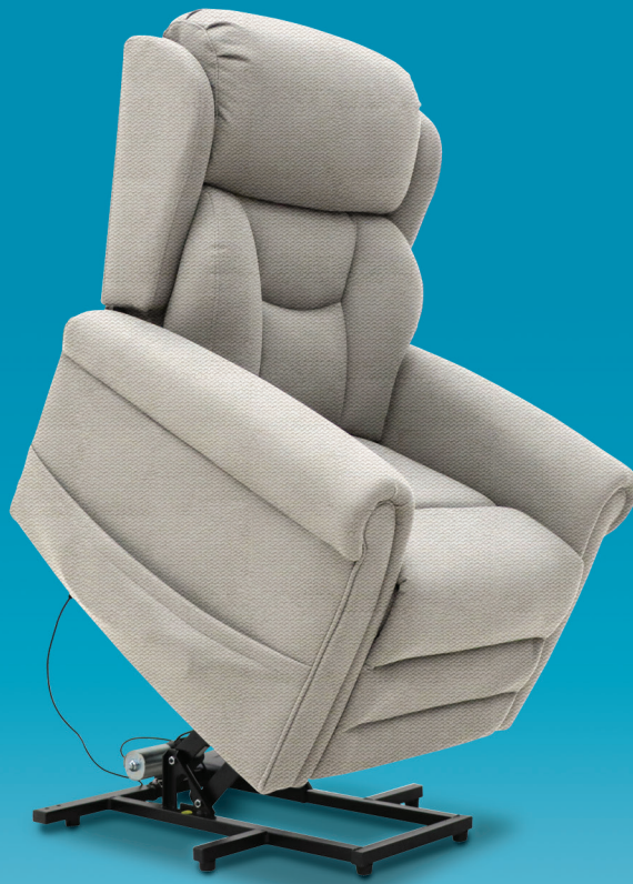
Rise & independently Recline