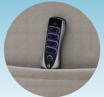
Easy to use controls