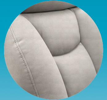
Cushioned lumbar support